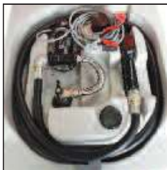
40 LPM 12v Pump Kit