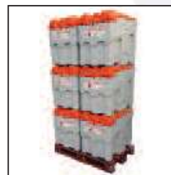
6 x DIP.P230