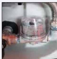
Fuel filter (water & particle)