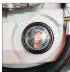
Contents Float Gauge