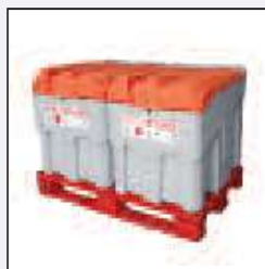
2 x DIP.P230