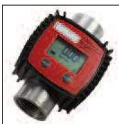
Digital Flow Meter