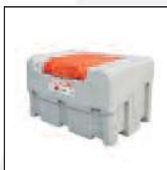
1 x DIP.P440