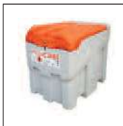
1 x DIP.P230