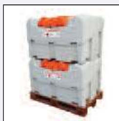
2 x DIP.P440