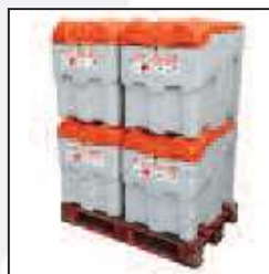
4 x DIP.P230