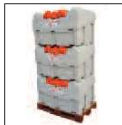
3 x DIP.P440